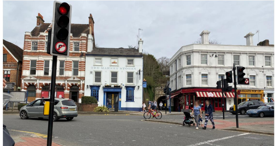
SURREY COUNTY COUNCIL AND REIGATE & BANSTEAD BOROUGH COUNCIL

• Will be used to inform infrastructure plans and support future funding bids to government and other sources DfT funding opportunities