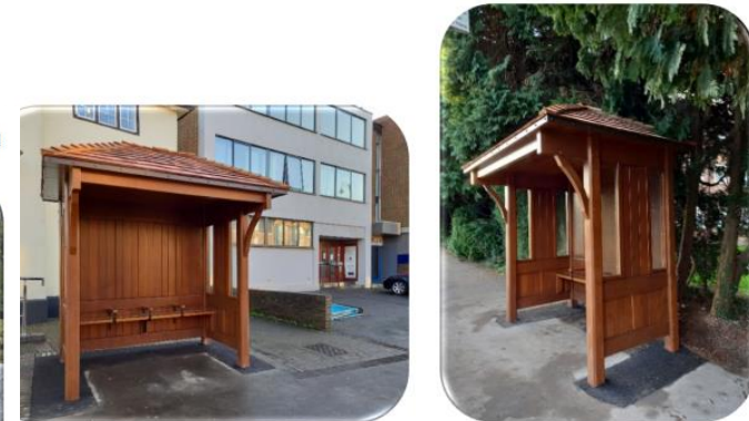
Figure 11: NW11 – Replacement of two wooden bus shelters on Banstead High Street.