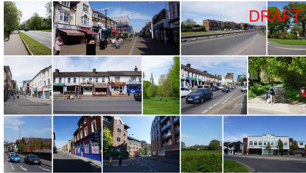
REIGATE & BANSTEAD BOROUGH COUNCIL A23 GREAT STREET DESIGN CODE (DRAFT) MARCH 2023