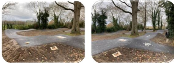
Figure 13: CW45 – BMX pump track and shelter at Sandcross Lane Skate Park, Woodhatch.